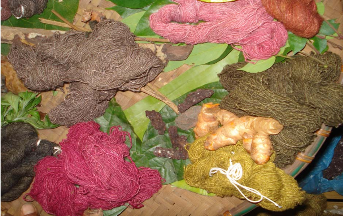
An array of Natural Dyes & Organic colours