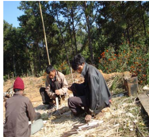
Male members of the village volunteering in cutting bamboo/cane at the Common facility centre at Mawkyndeng