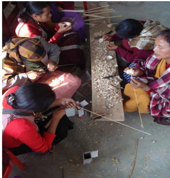
Women at work