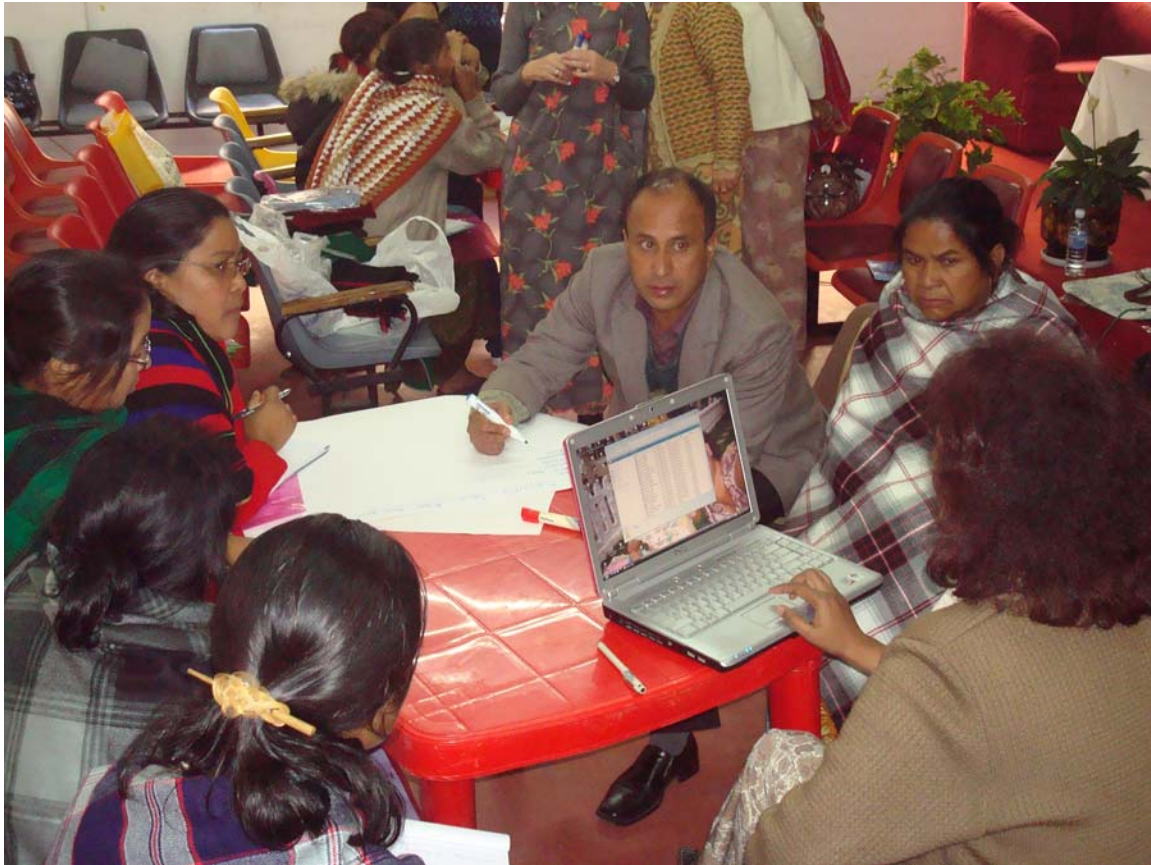
Creative participatory approach /presentations after group work