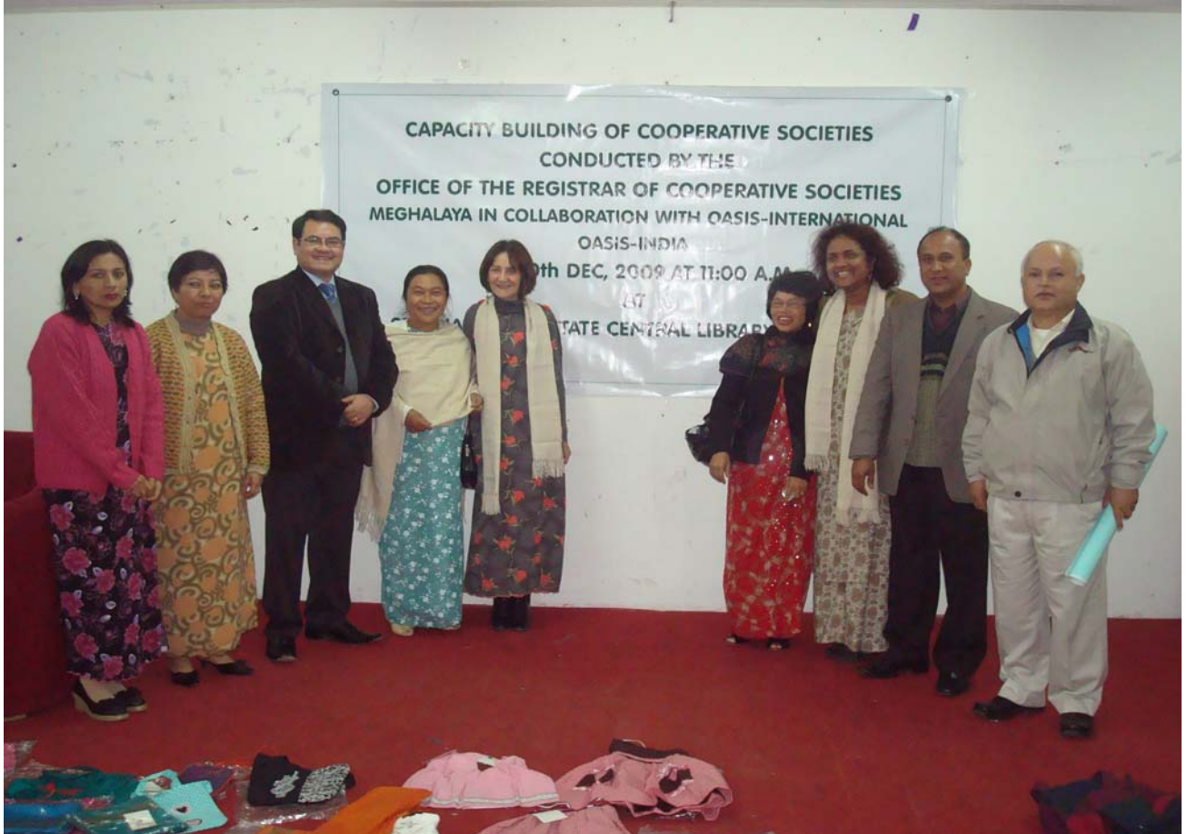
Valedictory Function of Resource Persons from OASIS INDIA ,JACOBS WELL & The Organizers-The Office of the Registrar of Cooperative Societies , Govt. Of Meghalaya