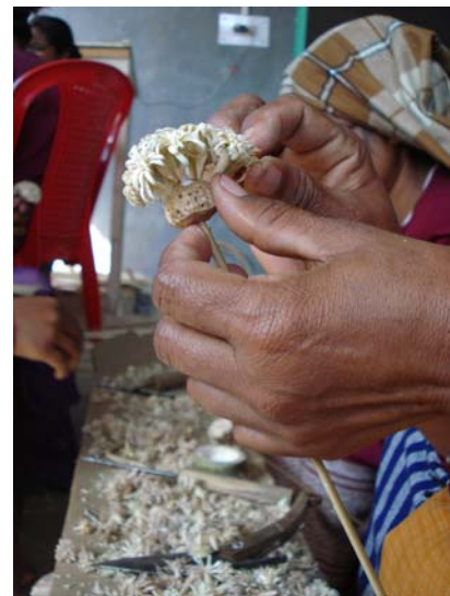
Womens Group collectively at work carving out decorative pieces from cane& bamboo