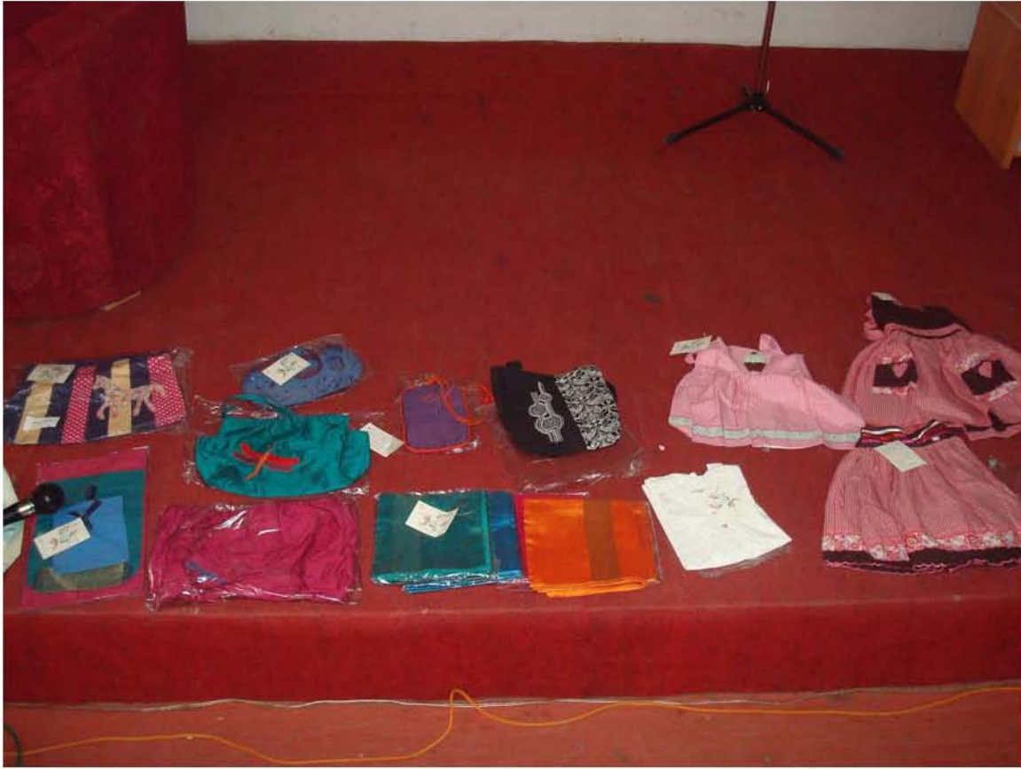
Jacobs Well products on display