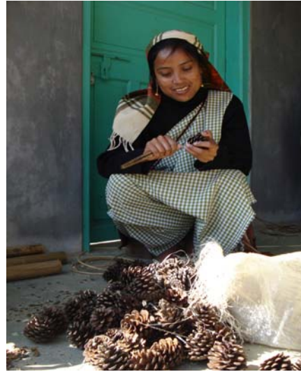
Carving out decorative items from pine cones – Womens Multipurpose Handicraft Society