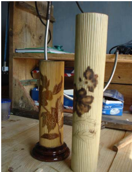
A finished decorative product ready for sale