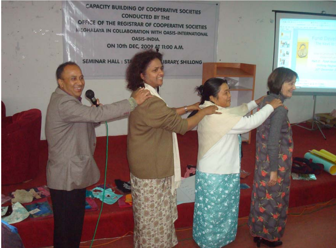
Creative training approaches imparted to infuse cooperative learning