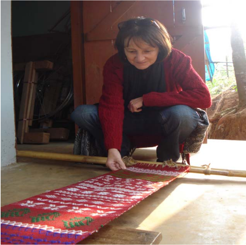
Feeling the local texture and marveling at the uniformity of patterns and colour schemes