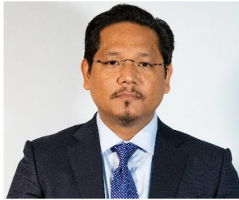
Shri. Conrad K. Sangma Hon'ble Chief Minister of Meghalaya

In order to improve the economic and nutritional status of the Meghalaya's population, our government has decided to launch a Rs. 209 Crore Piggery Mission implemented by the newly formed Meghalaya Livestock Enterprises Advancement Society (MLEADS).