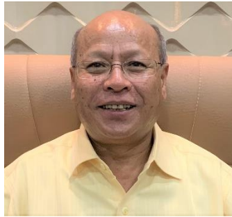
Shri. Prestone Tynsong

Hon'ble Deputy Chief Minister of Meghalaya i/c Animal Husbandry and Veterinary Department